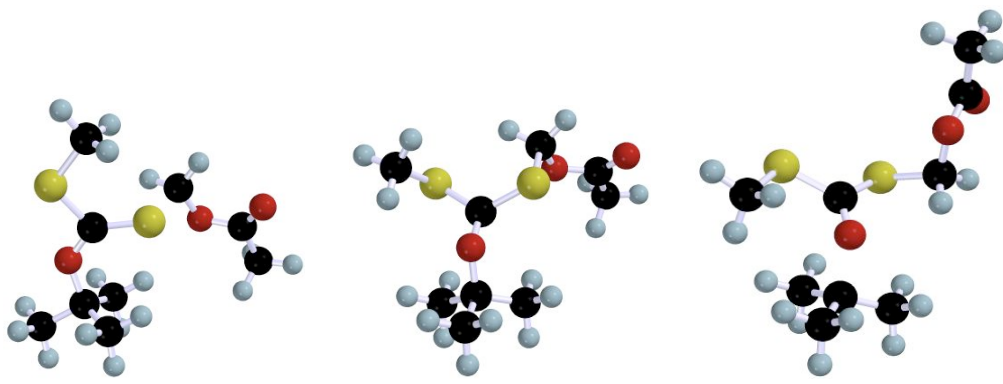
Addition and fragmentation in xanthate polymerisation – a new fragmentation pathway

The Australian-invented 'RAFT' procedure was developed to control the molecular weight and architecture of polymers resulting from free-radical polymerisation. I have been using quantum chemistry to build a detailed mechanistic picture of this important process with a view to designing improved RAFT agents for 'difficult' monomers, such as acrylonitrile. During the last year, I have provided explanations for why certain RAFT polymerisations are inhibited or retarded, and identified a previously unsuspected sidereaction in certain xanthate-mediated systems. This information is important for modelling the process and for choosing the right RAFT agent for the given application. Building on this work, and in close collaboration with the University of New South Wales, we have designed a new improved method for controlling free-radical polymerisation, which is currently being tested experimentally. In addition, I have been calculating important kinetic parameters in conventional radical polymerisation to assist in the interpretation of experimental data, and thereby develop an improved understanding of the polymerisation mechanism. (with C. Barner-Kowollik [UNSW], T.P. Davis [UNSW], C.E. Hovle [U. Southern Mississippi], L. Radom, and P. Vana [Georg-August-Universität Göttingen, Germany])